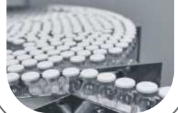
PHARMACEUTICALS & MICROBIOLOGY TESTING INSTRUMENTS