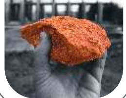
Soil Testing Instruments