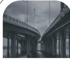
Cement-Concrete Testing Instruments