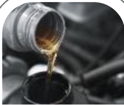
Petroleum Product Testing Instruments