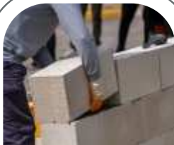
Paver / AAC Block Testing Instruments