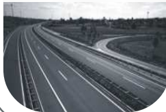
Bitumen Bituminous Mix/Modified Bitumen Testing Instruments