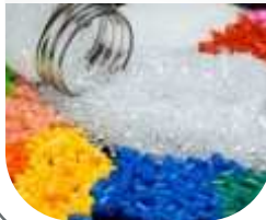
Plastic Testing Instruments