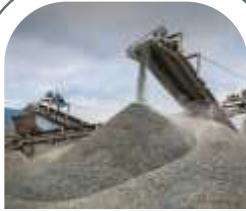
Aggregate Testing Instruments

We are engaged in offering a wide range of sturdy, elegant and reliable range of testing and measuring laboratory instruments. These instruments are manufactured using high grade material that are sourced from reliable vendors of market.