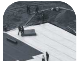
Geotextile Testing Instruments