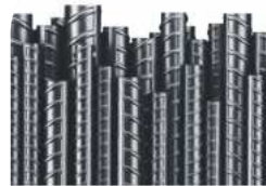
Steel- Metallurgical Testing Instruments